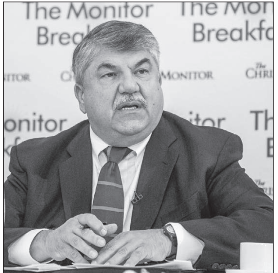
Richard Trumka President, AFL-CIO